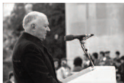
Joseph Wresinski – Trocadero 17 October 1987 – Paris (France)

In 1987, with 100,000 people, he launched a call to action carved in stone at the Trocadero Human Rights Plaza in Paris: